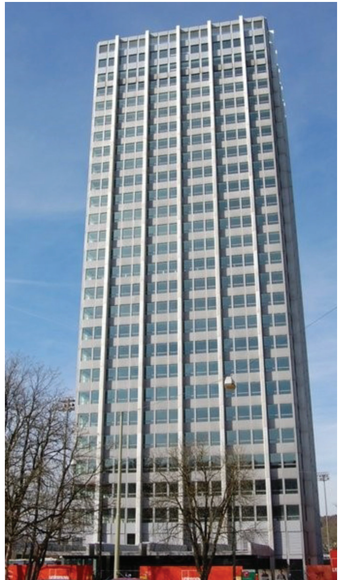
The Wintower building is situated in Northern Switzerland.