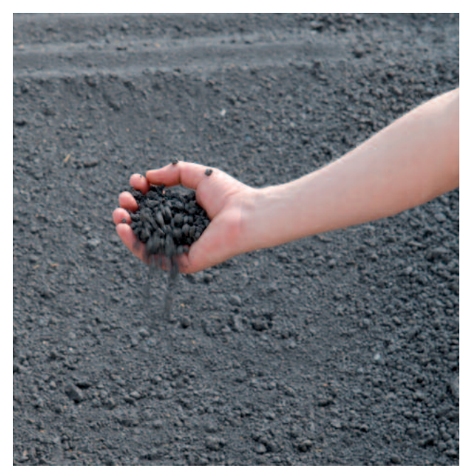
Free-flowing dried granulate