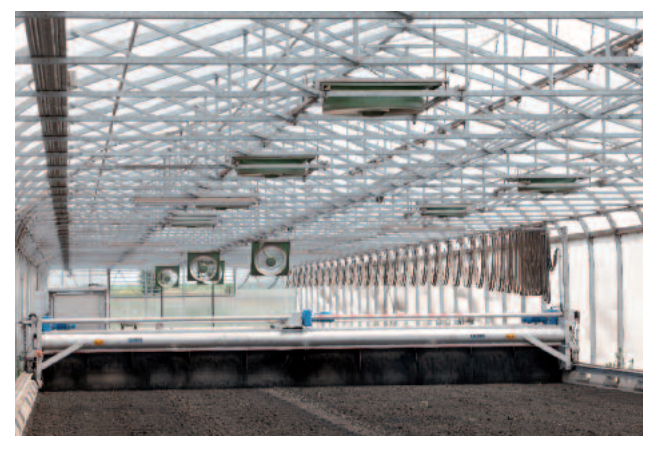
The sludge turner on its way through the greenhouse

The produced granulate is easy to handle due to its high solids concentration. The pea-sized granules are free-flowing.