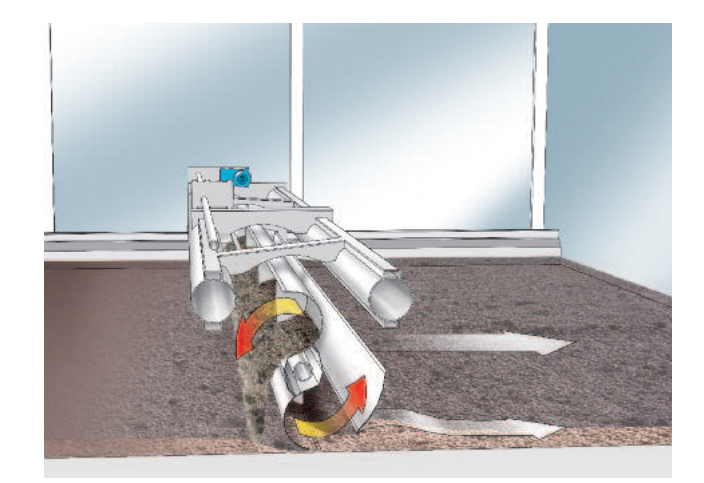
The rotating shovel of the sludge turner takes up sludge and spreads it on the sludge bed; As the turning device gradually travels forward, the entire bed is mixed and restacked

The sludge turner is made of corrosion resistant stainless steel and travels on low driveway walls to avoid shadows. The machine pulls itself through the greenhouse along chains and is safely guided. The electrical control system measures and records all relevant parameters. If requested, these data can be transferred to the main control station or made available for remote access via the internet.