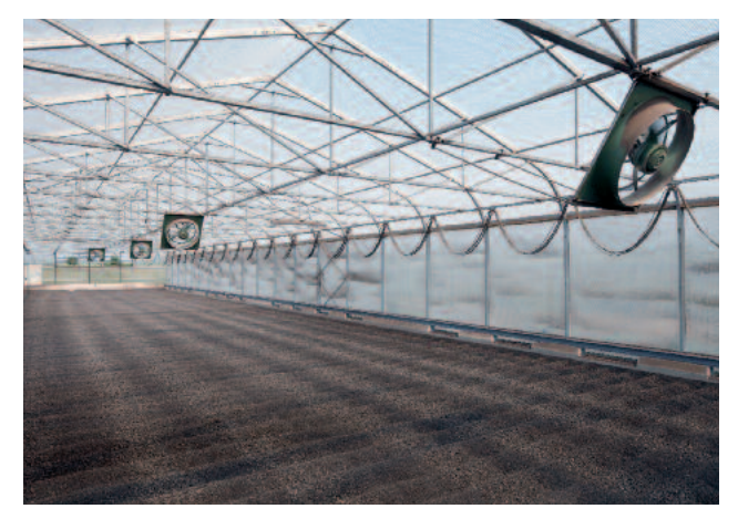
Ventilators blow dry air over the sludge bed.