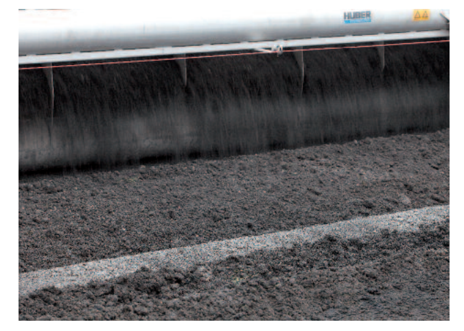
Backmixing and aeration of sludge

Supply of additional heat through highly efficient floor heating ensures maximum heat transfer with minor losses. Efficient evaporation permits space saving system design.